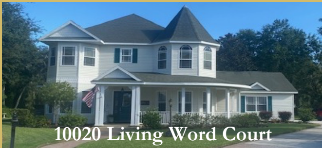
10020 Living Word Court