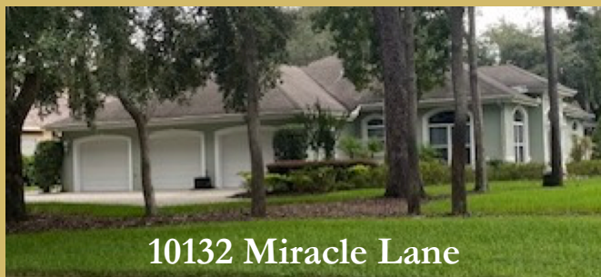
10132 Miracle Lane

Let's continue to celebrate the hard work and care everyone has put into their landscapes!