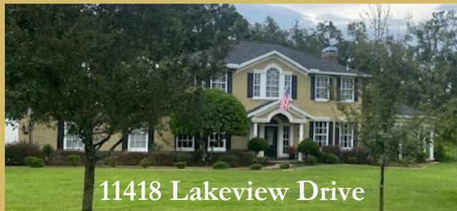
11418 Lakeview Drive