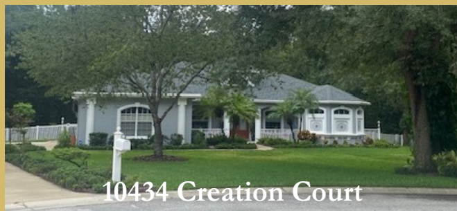
10434 Creation Court